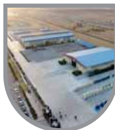
3. Parand Factory