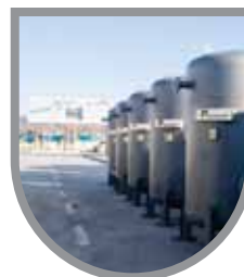
4. Parand (2) Factory