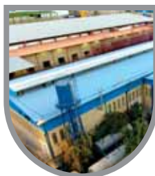
2. Vilashahr Factory