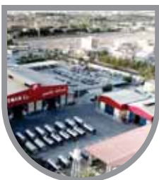
1. Isfahan Factory